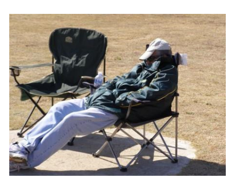
Rip van Winkel also attended